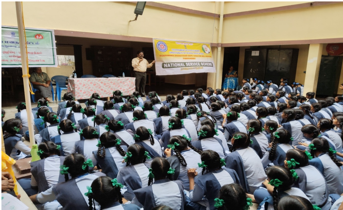
Title: Awareness Program on Mental Health and Substance Abuse